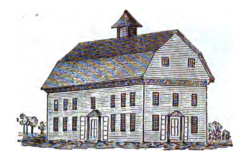
FIRST STATE-HOUSE AT HARTFORD. Commenced in 1719; occupied in 1730; frame building, 30 x 70 feet, 34 feet in height.